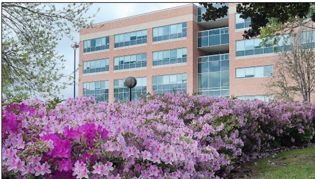
College of Humanities and Social Sciences Building

The MPA program does not have a thesis requirement or a thesis option.